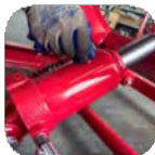
1). Open the oil plug