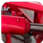
3). Put the oil plug back