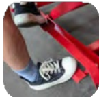
2). One foot steps on the drop foot pedal constantly and another foot steps on the lift foot pedal repeatedly at the same time.